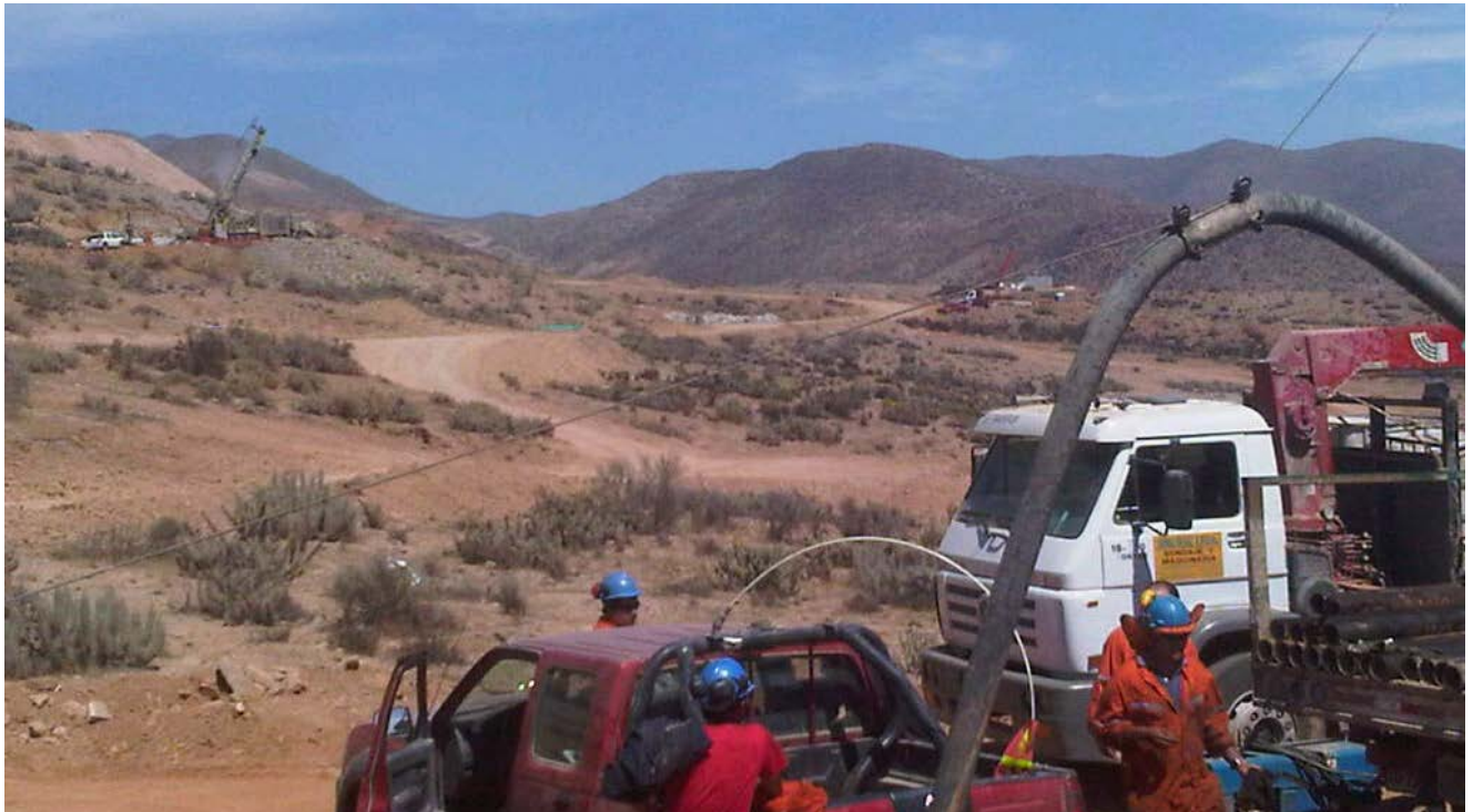
Resource drilling at Hot Chili's Productora project in May 2011